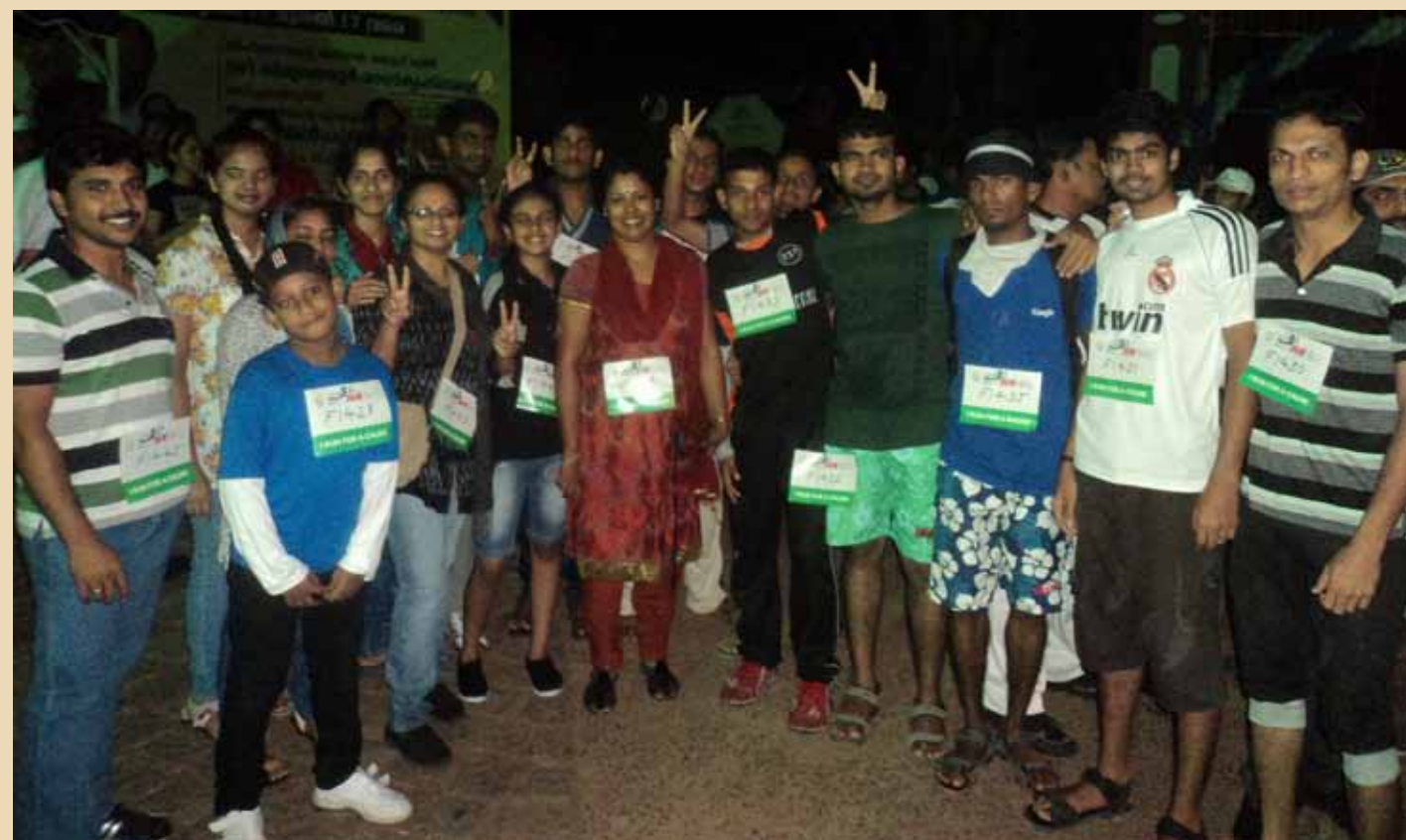
NISH staff & students participated in the 'TrivandRun 2014' marathon organised by SAR-SAS- Save a Rupee Spread a Smile, a Trivandrum based registered charitable society , to raise funds for needy cancer patients in RCC- Regional Cancer Centre.