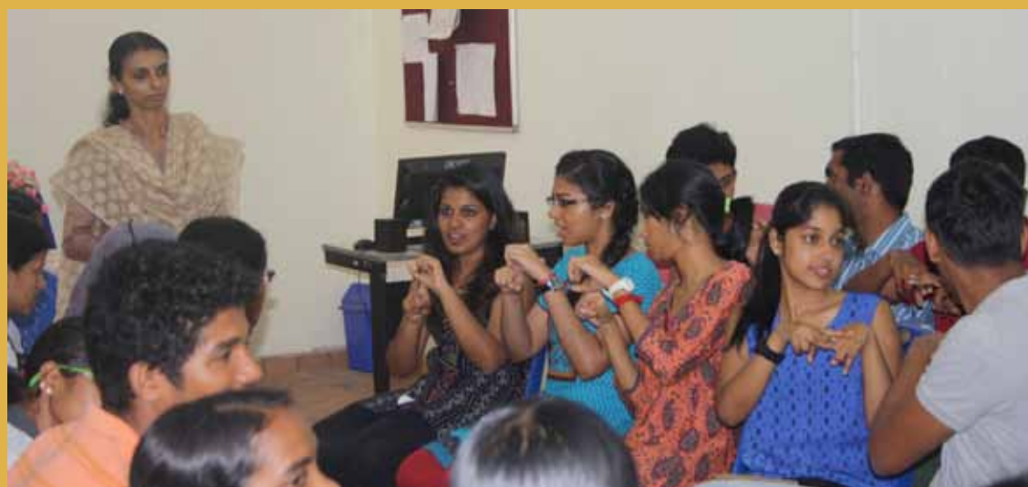
Volunteers from Singapore Indian Association (SINDA) interacting with Degree HI students. They visited NISH as part of their SINDA Young Leaders Programme (SYLP 2014) on 21st March 2014.