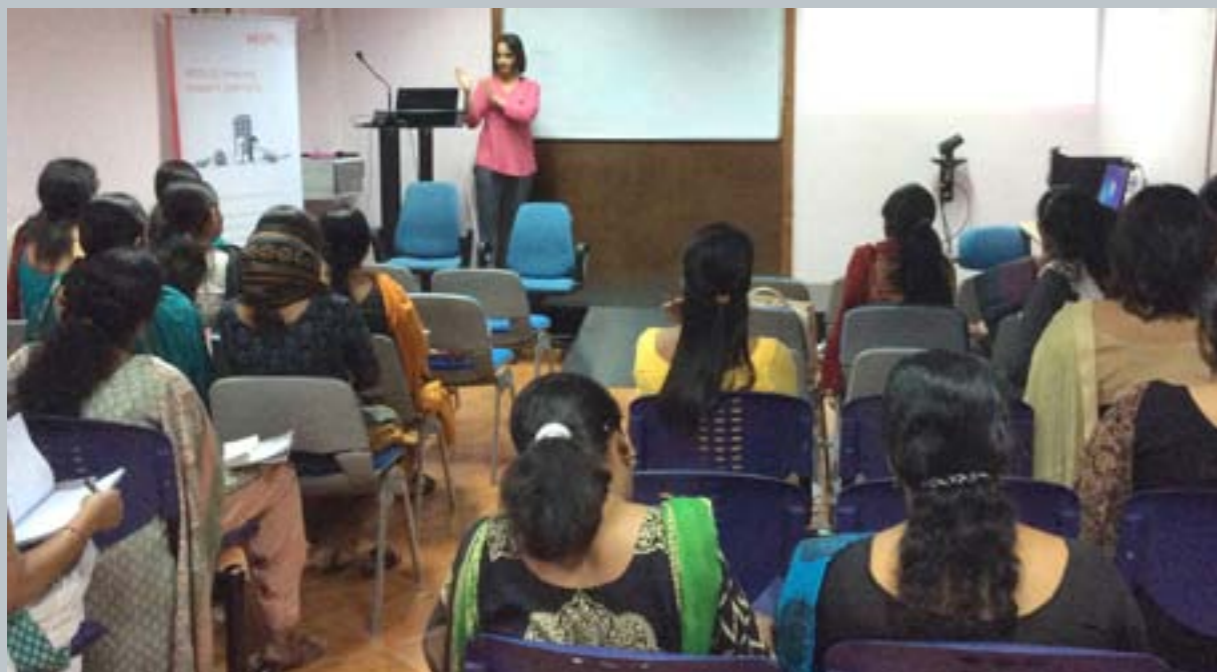
NISH became the venue for a three day training program for the audiologists and AVT therapists by the Cochlear Implant company MED*EL from June 5th to 7th.