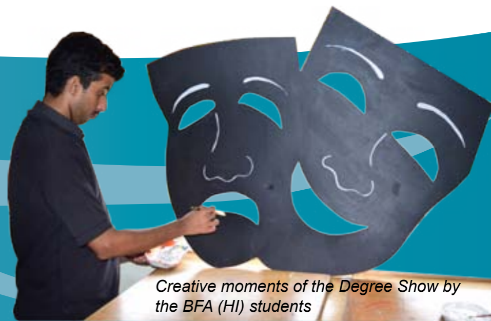
Creative moments of the Degree Show by the BFA (HI) students