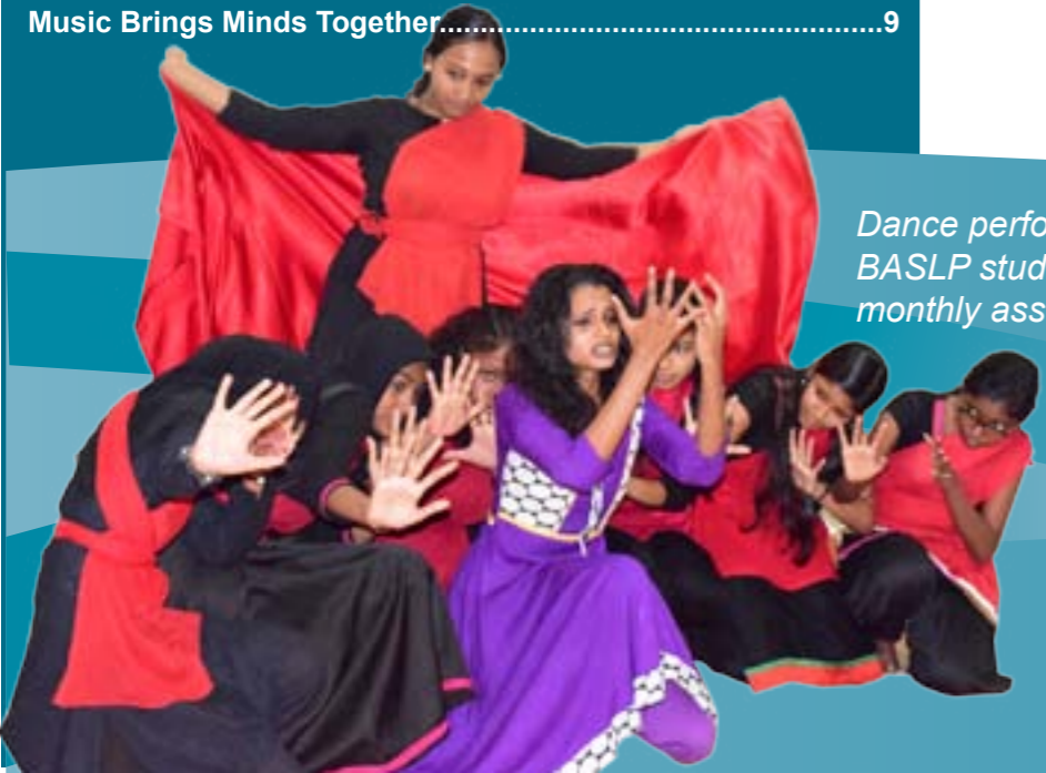
Dance performance by BASLP students during monthly assembly at NISH