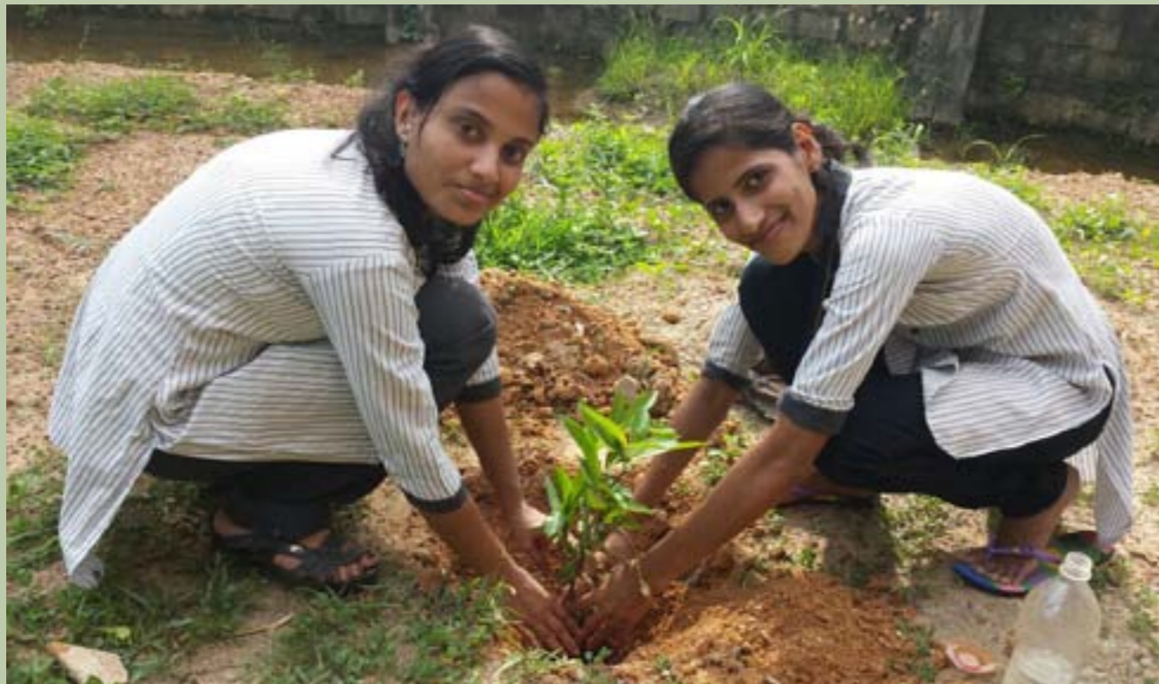
NISH students celebrating the World Environment Day on June 5th, 2015 by planting saplings in the campus.