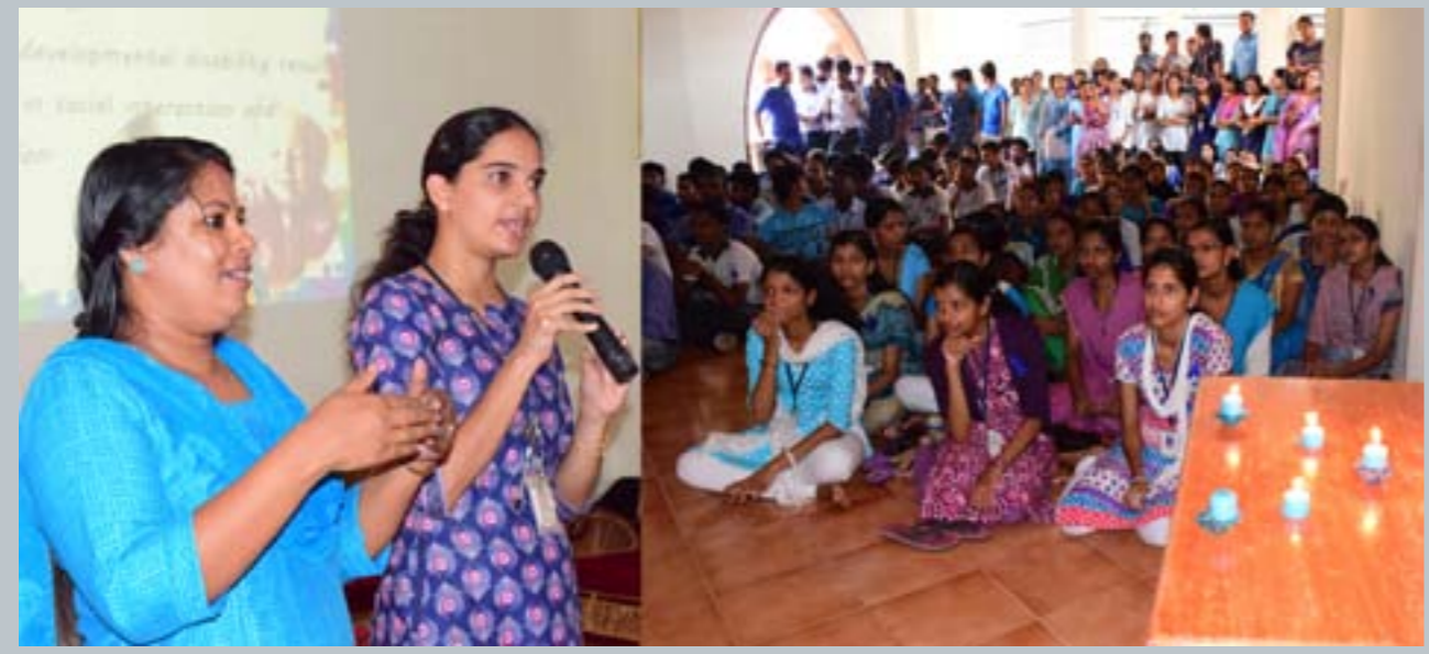
The students of NISH organised a monthly assembly on April 7, the Autism Awareness Day. Many students & staff wore blue colour dress to exhibit their awareness towards Autism.