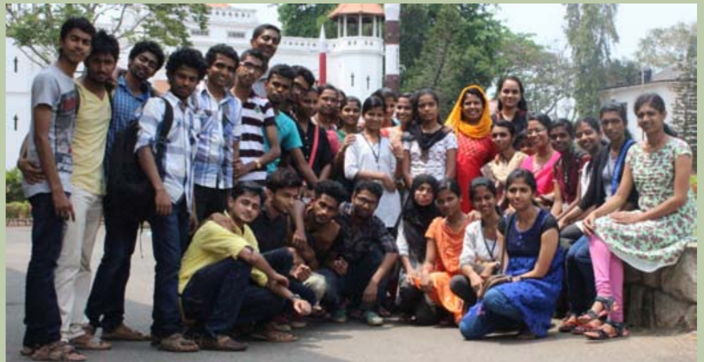
B.Sc. (CS)(HI) students & staff at Science & Technology Museum, Trivandrum in connection with World Science Day celebrations.