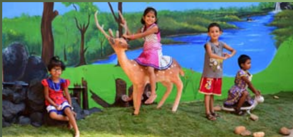
Children of Early Intervention Programme at the beautified playground

The BFA department was asked to transform the Early Intervention Program enclave to be child friendly. They filled the place with unique ideas that revealed their creativity. The selfless commitment of Rakesh and Shiju was evident in the efforts they took in motivating the BFA(HI) students to make this an excellent art project.