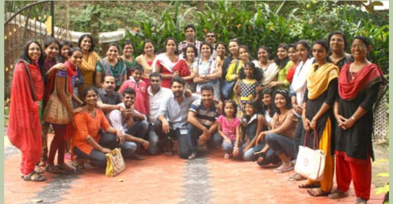
NISHIANS at Rivercounty resort, Kallar during staff tour 2014.