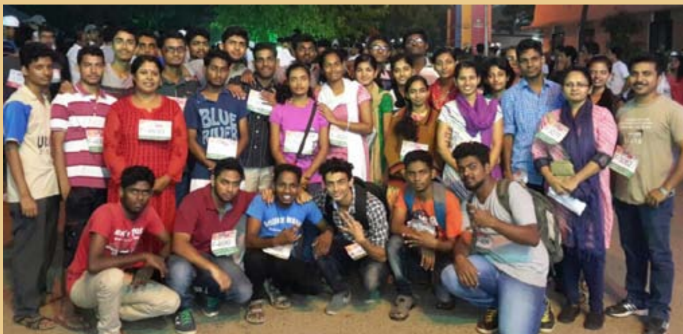
NISH staff & students participated in the mass run organised by SARSAS- Save a Ru-pee Spread a Smile, a Trivandrum based registered charitable society to raise funds for needy kidney patients.