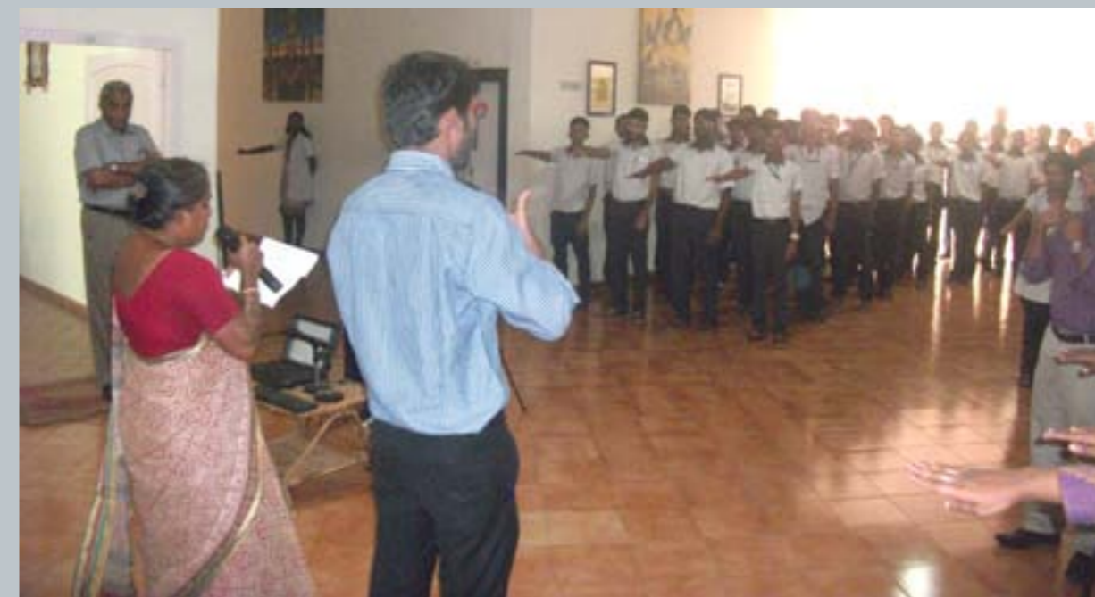
Staff & students of NISH taking oath on Human Rights Day on 10th December, 2014.