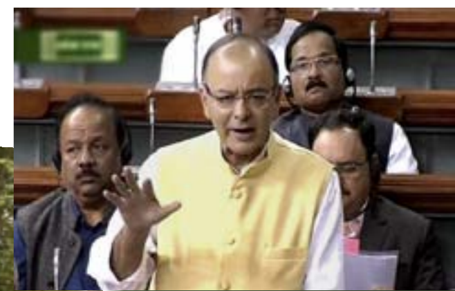
Hon'ble Union Finance Minister, Shri. Arun Jaitley declaring NISH as National University while presenting the Union budget.