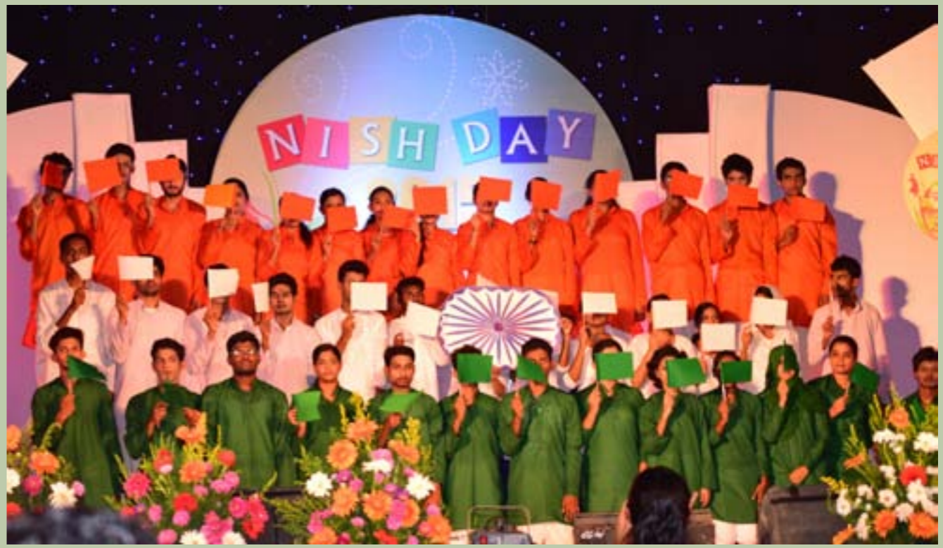
Visualization of 'Vande Mataram' using Indian Sign Language by BASLP & Degree (HI) students.