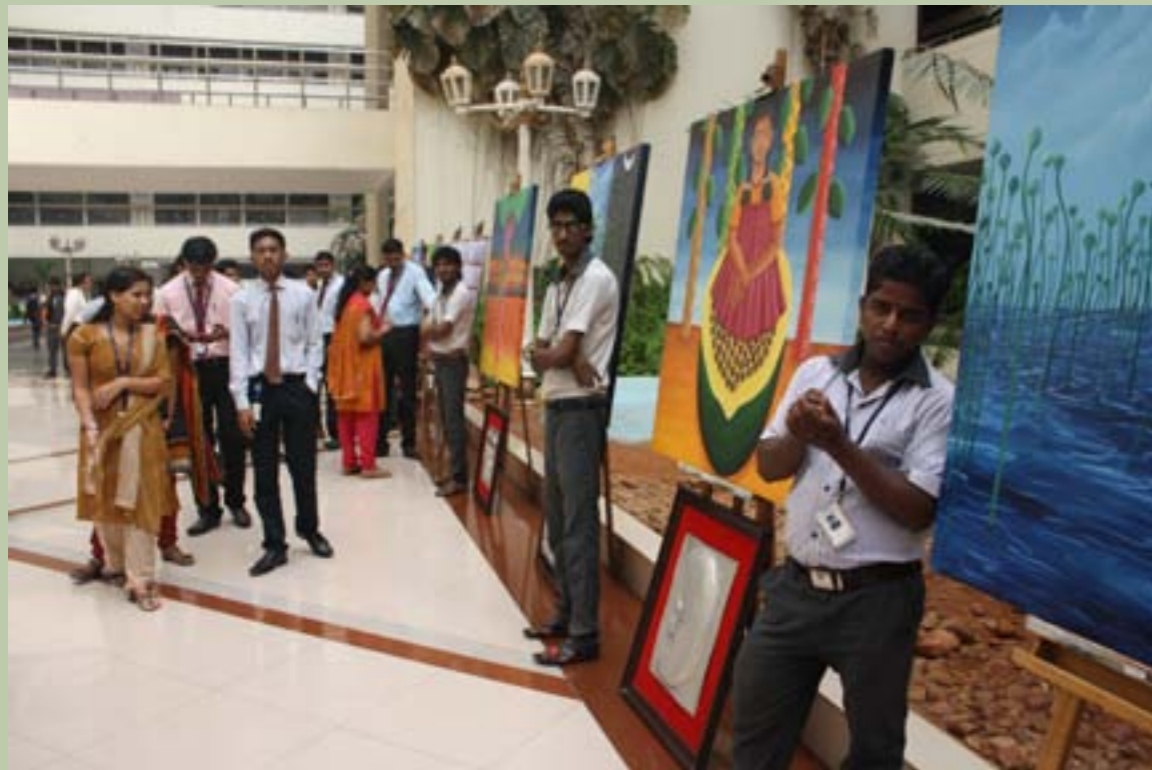
BFA (HI) students exhibiting their art works at Bhavani Atrium, Technopark during the 'Art Exhibition cum Sale' organized by UST Global on 9th December 2014.