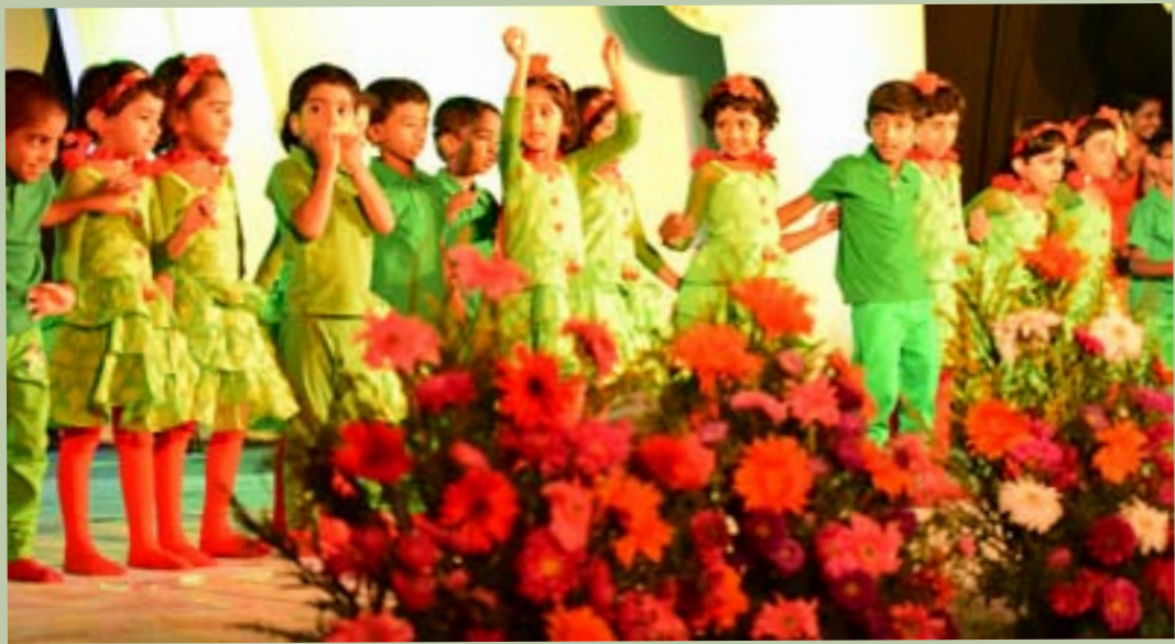
Colourful performance of the EIP children