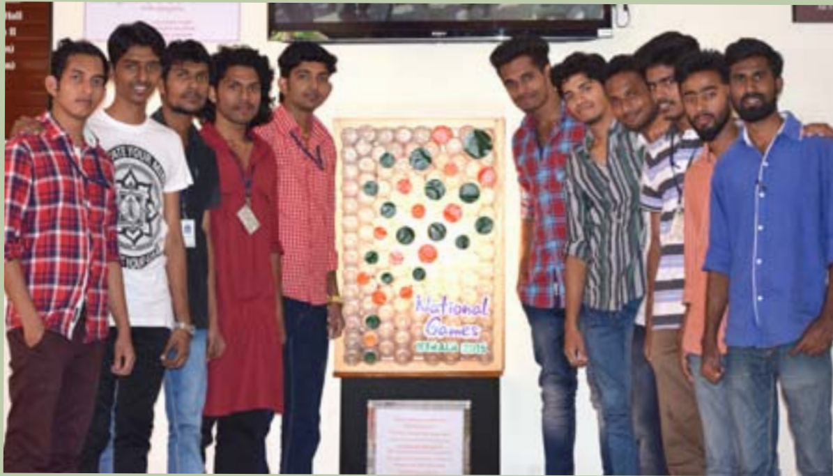
The creative team of BFA(HI) students with the installation of the National Games logo created using the water bottles distributed during the 'Run Kerala Run' event at NISH.