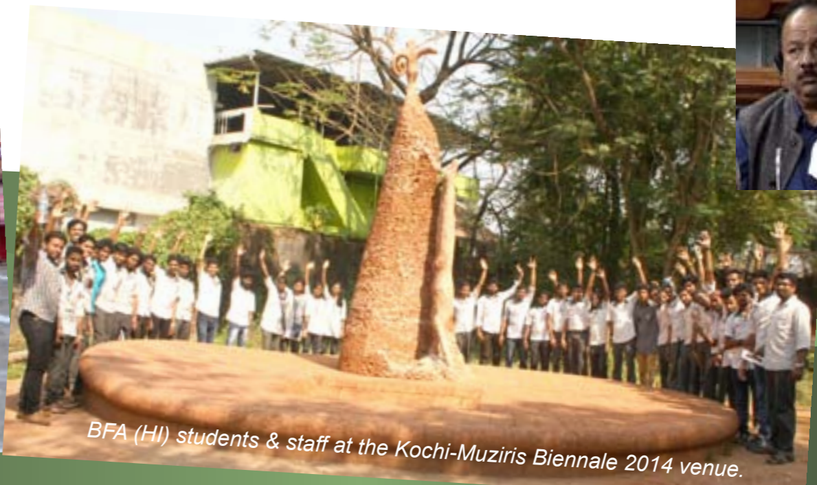
BFA (HI) students & staff at the Kochi-Muziris Biennale 2014 venue.