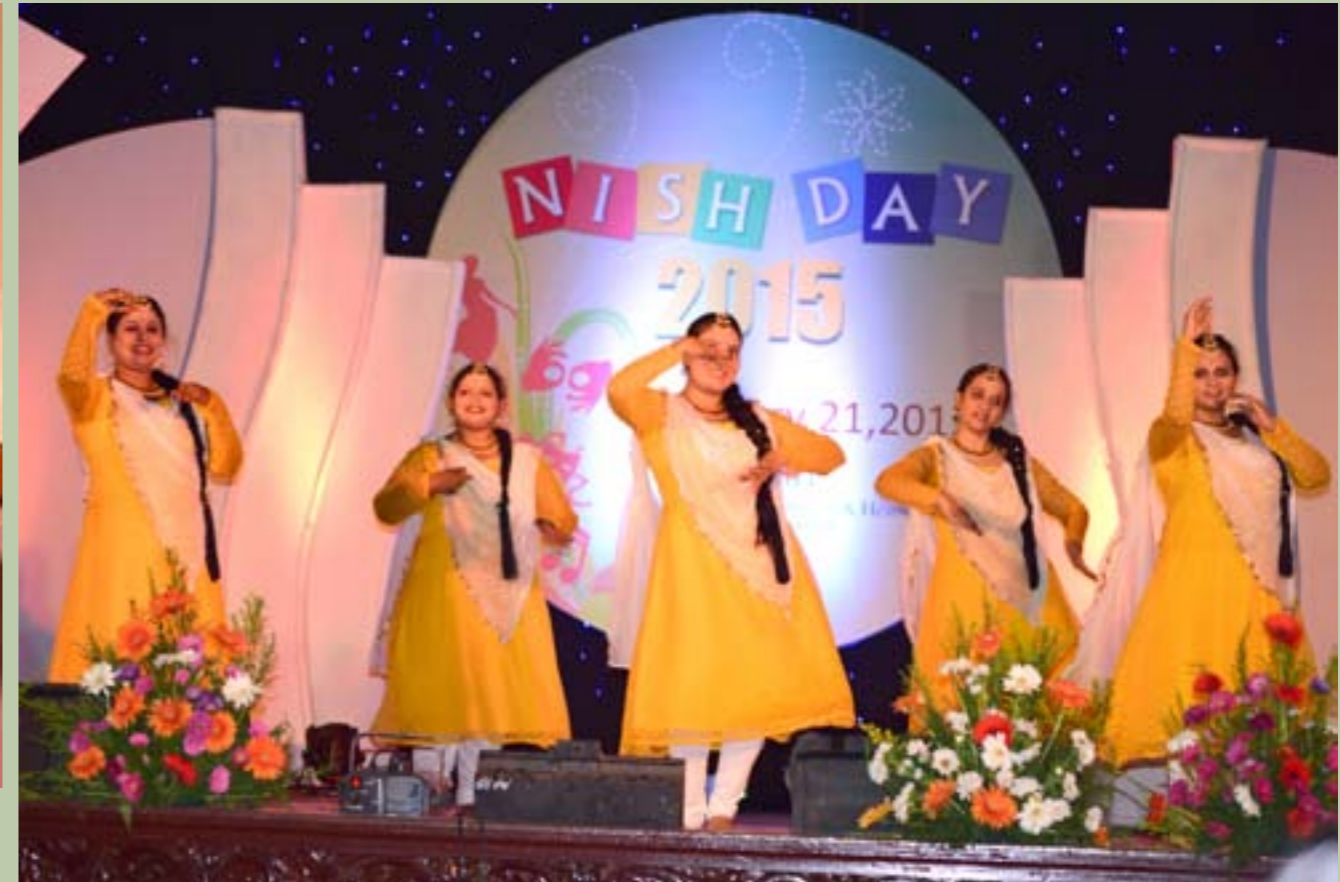
Rhythmic dance performance of the NISH staff