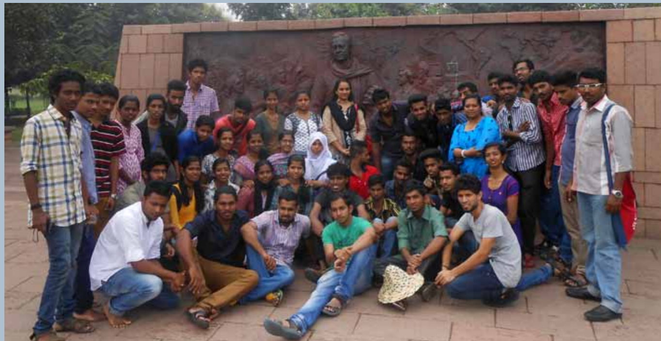
Students & staff of Degree (HI) at Veer Bhoomi (memorial of Rajiv Gandhi) during their visit at Delhi as part of All India Tour 2014.