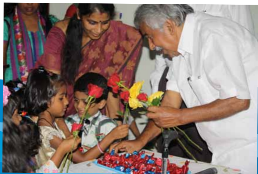
Preschool children greeting Chief minister during his visit at NISH