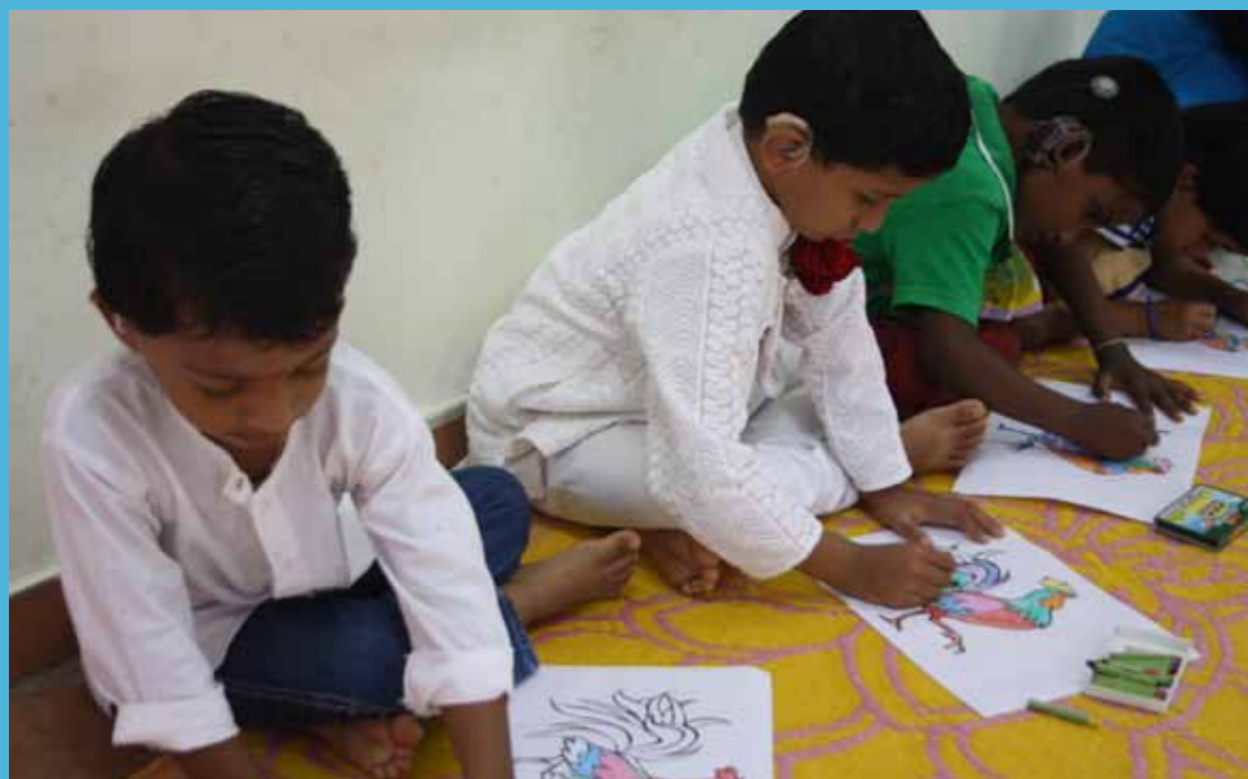
Colouring competition conducted as part of Children's day celebration organized by Student's Union at NISH.