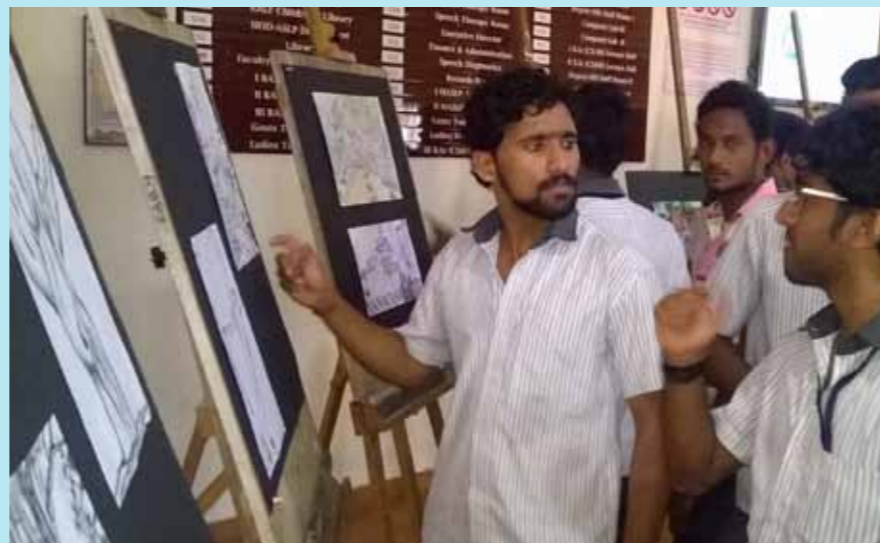
“Essence of Nature” - Two days Art Exhibition at NISH Lobby by Bachelor of Fine Arts students.