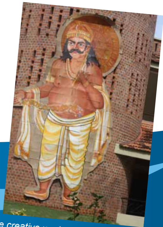
The creative work of the BFA Dept. adding splendour to the Onam Day Celebrations