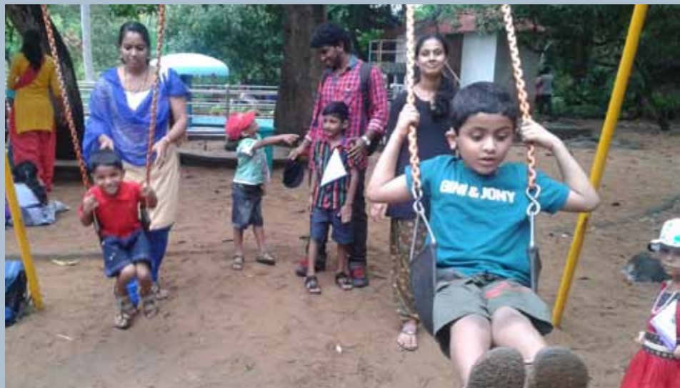
Children of Early Intervention Programme at Veli Tourist Village. They also visited Marine Aquarium, Vizhinjam.