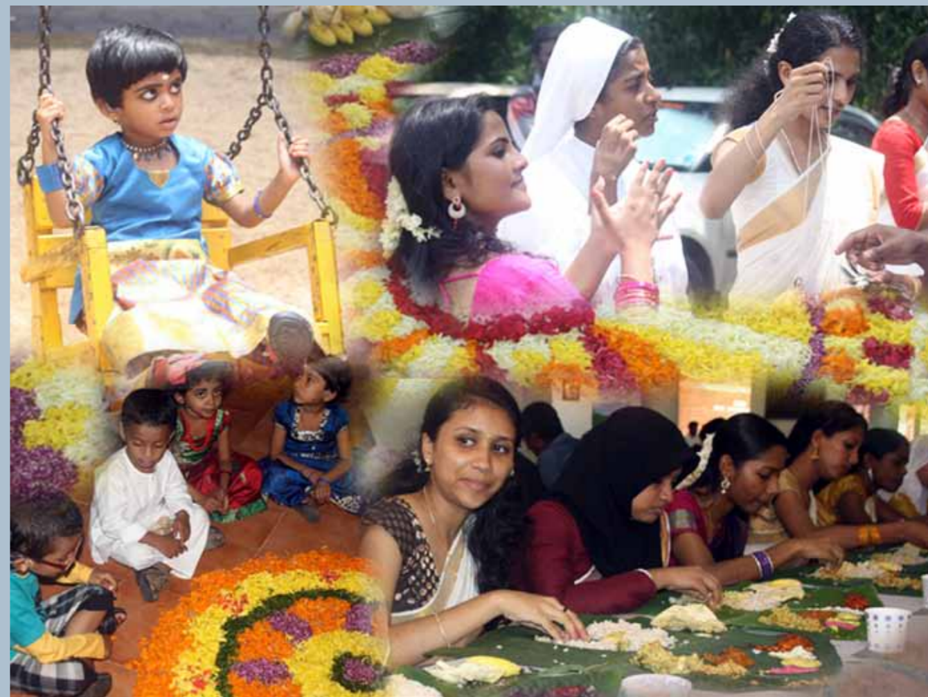
Moments from Onam celebration organized by Student's Union at NISH.