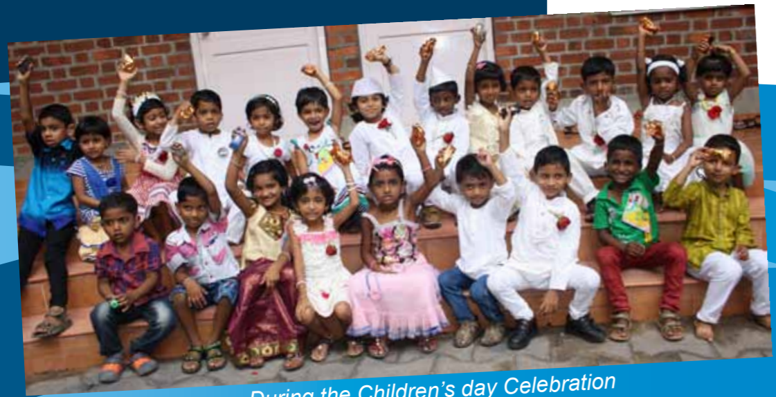
During the Children's day Celebration